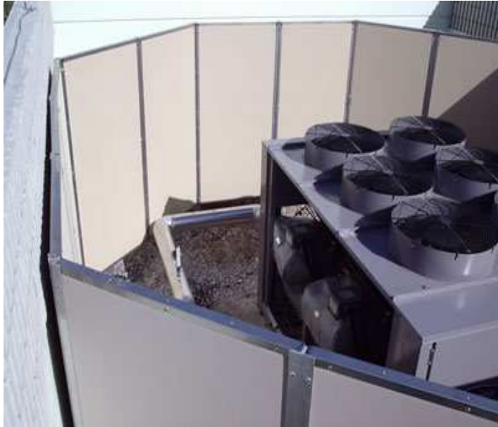
TOP VIEW OF INSTALLATION

CHILLER UNIT IS APPROXIMATELY 50 FT FROM THE PROPERTY LINE.